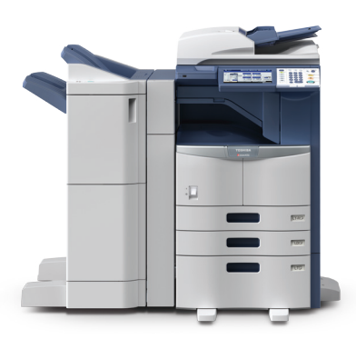
e-STUDIO456 with 2,000-Sheet LCF, Hole Punch, and 50-Sheet Staple Console Finisher.