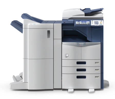
e-STUDIO456 with 2,000-Sheet LCF, Hole Punch, and Saddle-Stitch Finisher.